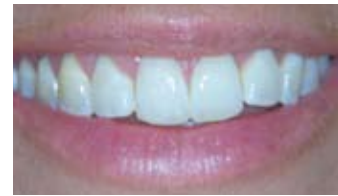
Vanish™ 5% Sodium Fluoride White Varnish applied to tooth surface