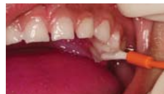
Vanish™ 5% Sodium Fluoride White Varnish sets rapidly in the presence of saliva