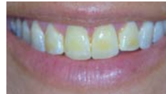
Traditional varnish applied to tooth surface